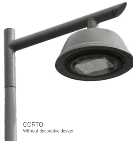
CORTO Without decorative design